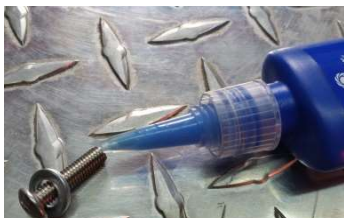
Use blue thread lock 2ea 5mm x 16 mm bolts