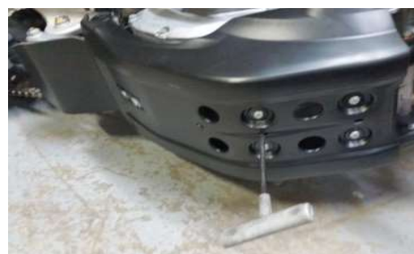
Start all allen bolts through the skid plate then tighten the bolt in the middle of each mounting plate.