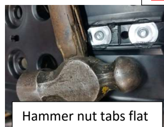
Hammer nut tabs flat