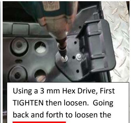
Using a 3 mm Hex Drive, First TIGHTEN then loosen. Going back and forth to loosen the red thread lock