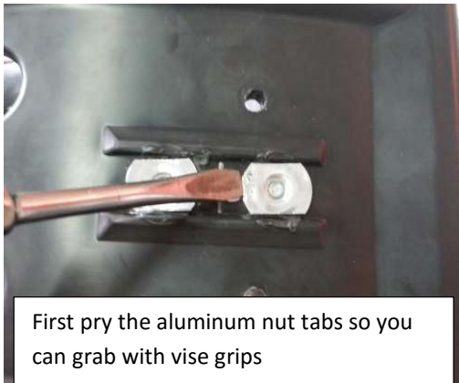
First pry the aluminum nut tabs so you can grab with vise grips

When installing an Xtreme Link Guard first you need to remove the bolted on plastic tab that goes over the back of the frame cross-tube. Since these two 5mm allen bolts were installed with red thread lock extra effort is needed to remove these bolts. Important Note: This step has to be completed before this install of the extreme Obie Link Guard can be achieved. The standard KTM250450F-16-KP1 will work if this cannot be completed (It slips over the hook).