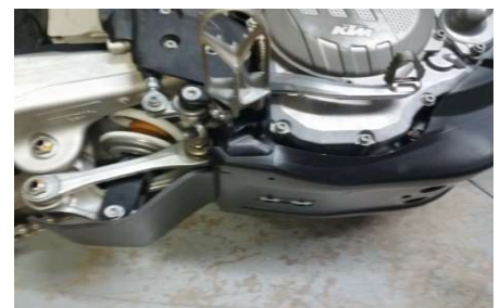
The NEW 2016 4-stroke chassis makes the linkage hang lower than previous model years