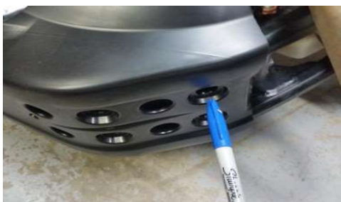
Next put the skid plate on without the metal mounting brackets. Mark the engine so you know where to mount the metal mount/tabs