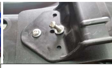
Insert the new longer bolts