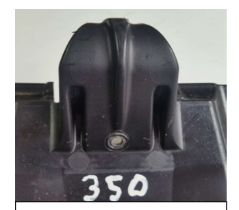
Drill one 3/16 or 5mm hole, at end of the center rib of the hook

Recommended Installation: One hole on the small tab is provided on the Obie Link Guard for your convenience. First, center punch at the end of the center rib on the plastic hook on the skid plate and drill a 3/16 or 5 mm (drill bit not included) hole in your skid plate. Second, slide the Obie Link Guard over the hook and the small tab with the hole under the skid plate. Insert the bolt (Allen head down – nut & washer up) and tighten the nut (removing the link guard is not needed after attaching to the skid plate). Always mount the Obie Link Guard between the frame and your skid plate for a smooth transition from skid plate to link guard. Doing this will keep your Link Guard attached to your skid plate even when you go backwards against debris which has now has more leverage on your skid plate.