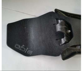
1 ea 5mm x 16 mm & Ny-lock Nut and Washer supplied – Ready to Install