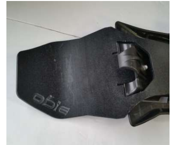
1 ea 5mm x 16 mm & Ny-lock Nut and Washer supplied – Ready to Install