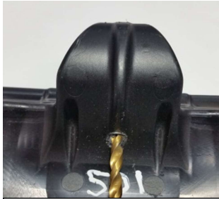
Drill one 3/16 or 5mm hole, at end of the center rib of the hook

Recommended Installation: One hole on the small tab is provided on the Obie Link Guard for your convenience. First, center punch at the end of the center rib on the plastic hook on the skid plate and drill a 3/16 or 5 mm (drill bit not included) hole in your skid plate. Second, slide the Obie Link Guard over the hook and the small tab with the hole under the skid plate. Insert the bolt (Allen head down – nut & washer up) and tighten the nut (removing the link guard is not needed after attaching to the skid plate). Always mount the Obie Link Guard between the frame and your skid plate for a smooth transition from skid plate to link guard. Doing this will keep your Link Guard attached to your skid plate even when you go backwards against debris which has now has more leverage on your skid plate.