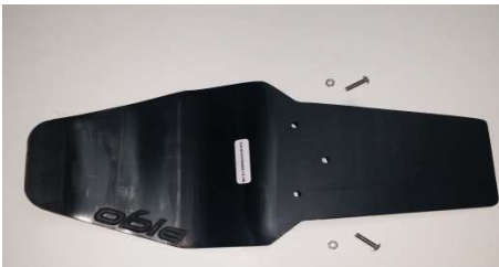
2 - 5 x 20 mm & 5 mm ny-lock nuts