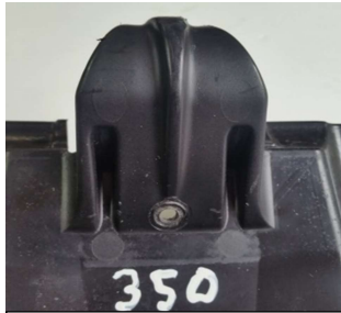
Drill one 3/16 or 5mm hole, at end of the center rib of the hook

Recommended Installation: One hole on the small tab is provided on the Obie Link Guard for your convenience. First, center punch at the end of the center rib on the plastic hook on the skid plate and drill a 3/16 or 5 mm (drill bit not included) hole in your skid plate. Second, slide the Obie Link Guard over the hook and the small tab with the hole under the skid plate. Insert the bolt (Allen head down – nut & washer up) and tighten the nut (removing the link guard is not needed after attaching to the skid plate). Always mount the Obie Link Guard between the frame and your skid plate for a smooth transition from skid plate to link guard. Doing this will keep your Link Guard attached to your skid plate even when you go backwards against debris which has now has more leverage on your skid plate.