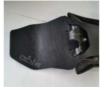
1 ea 5mm x 16 mm & Ny-lock Nut and Washer supplied – Ready to Install